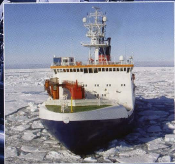
Turbo couplings for ice breakers