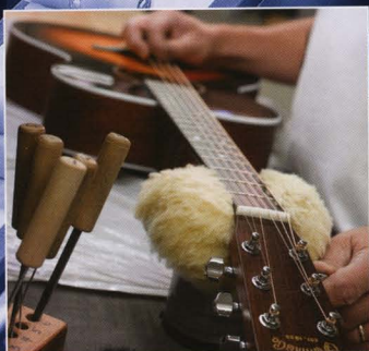
Motion control for guitar manufacturing

Fidel, Pentache Post AG, Bismarckstr. 1 / Betrieben : Postfach 1072 39243 Hildersheim