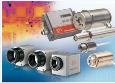
Sensors and measurement devices for non-contact temperature measurement