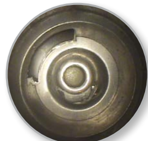
Checking brake cylinder for burrs