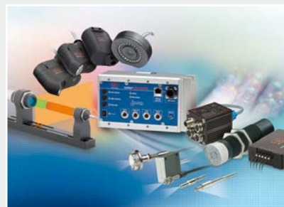
Color recognition sensors, LED analyzers and color online spectrometer