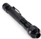
LED hand-held light source