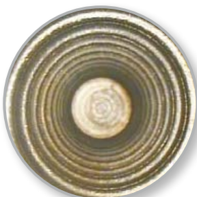
Inspecting screw threads