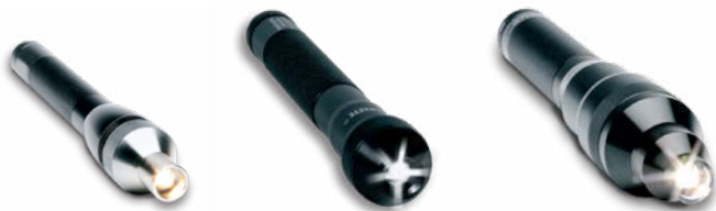
Mini Maglite hand light source