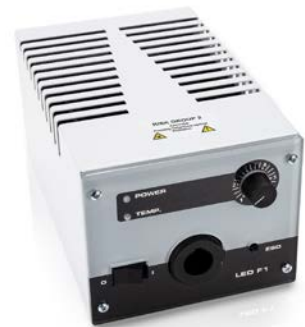
FOT LED without fan

*depending on the ambient temperature, room humidity and the intensity set