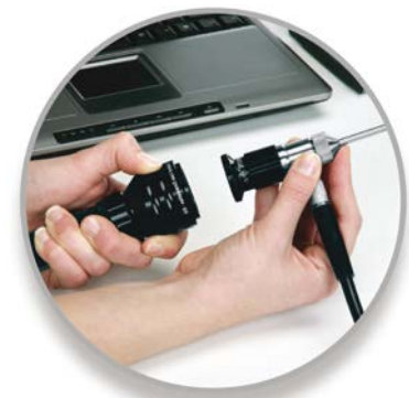
Attachment of camera and lens onto endoscope