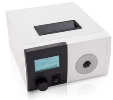
FOT LED 3000 / 5000