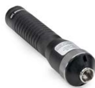
SuperNova LED hand light source