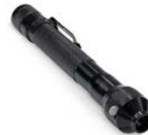
LED hand light source