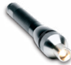
Mini Maglite hand light source