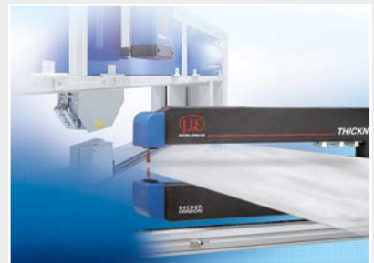
Measurement and inspection systems