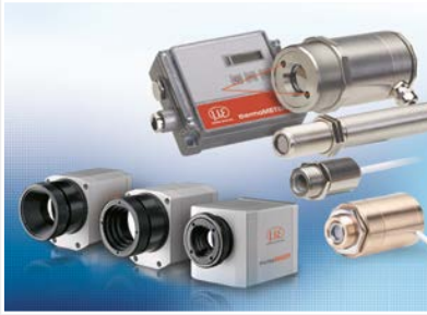
Sensors and measurement devices for non-contact temperature measurement