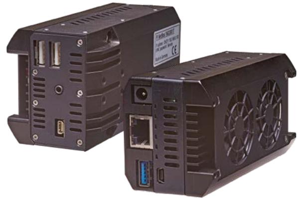
thermoIMAGER TIM NetBox