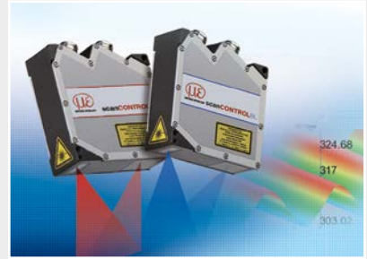
2D/3D profile sensors (laser scanner)