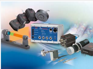
Color recognition sensors, LED analyzers and color online spectrometer