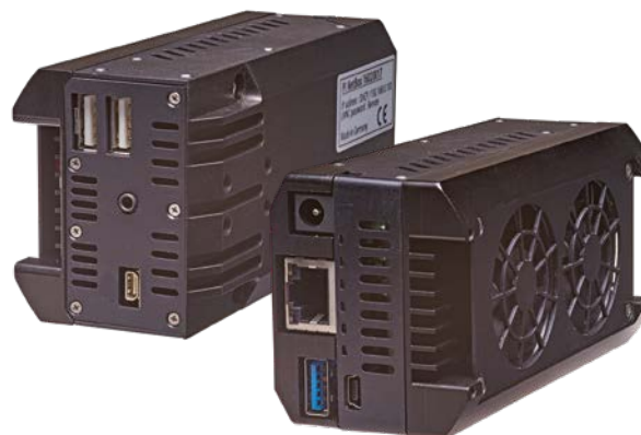
thermoIMAGER TIM NetBox